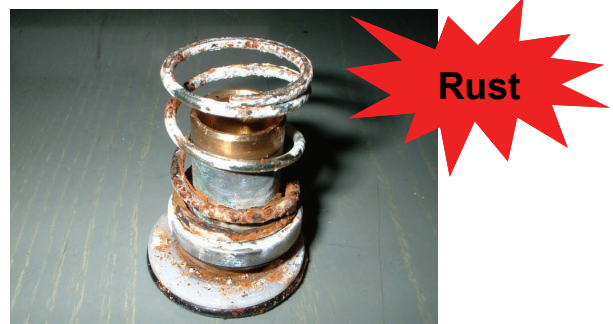
Brake Valve Spring