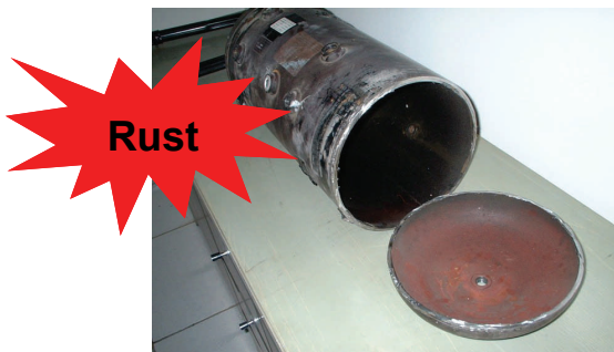
Air Reservoir Tank